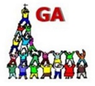
Annual general assembly

This year, our Annual General Assembly (AGA) will take place on July 26 (Sunday) from 12 noon in the Church.